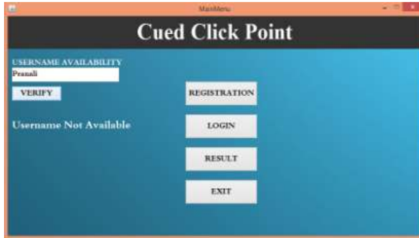
Fig.3. Simulation Environment

The system is developed in NetBeans Environment using Java to develop password authentication system. Fig.3 shows the simulation environment of the system.