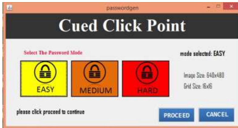
Fig.4. Mode selection

Figure Mode Selection: Select the levels which decide the size of viewport.